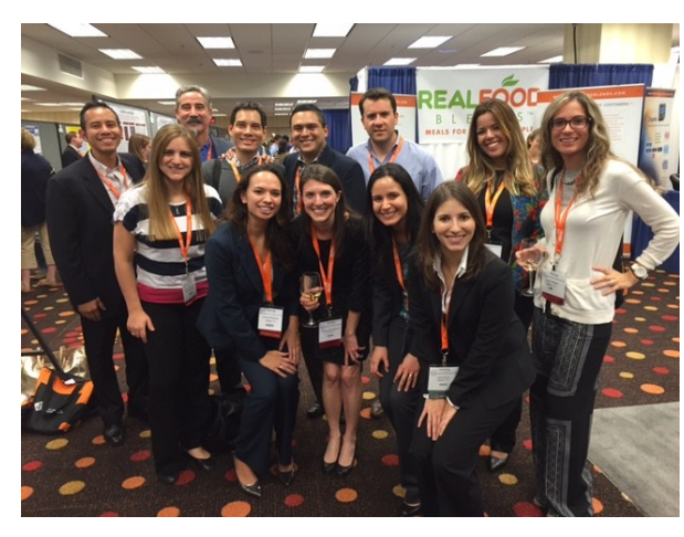
MCH Residents and Graduates at 2014 NASPGHAN

2008-2013 Using the pediatric health information system [Phis] Database"